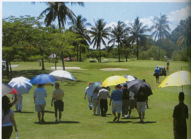
The gallery with umbrellas at the 10th. The number grew to 400 by the time the championship flight reached the 18th

over-par 73 final round saw him share 10th place on 16-over-par 296.