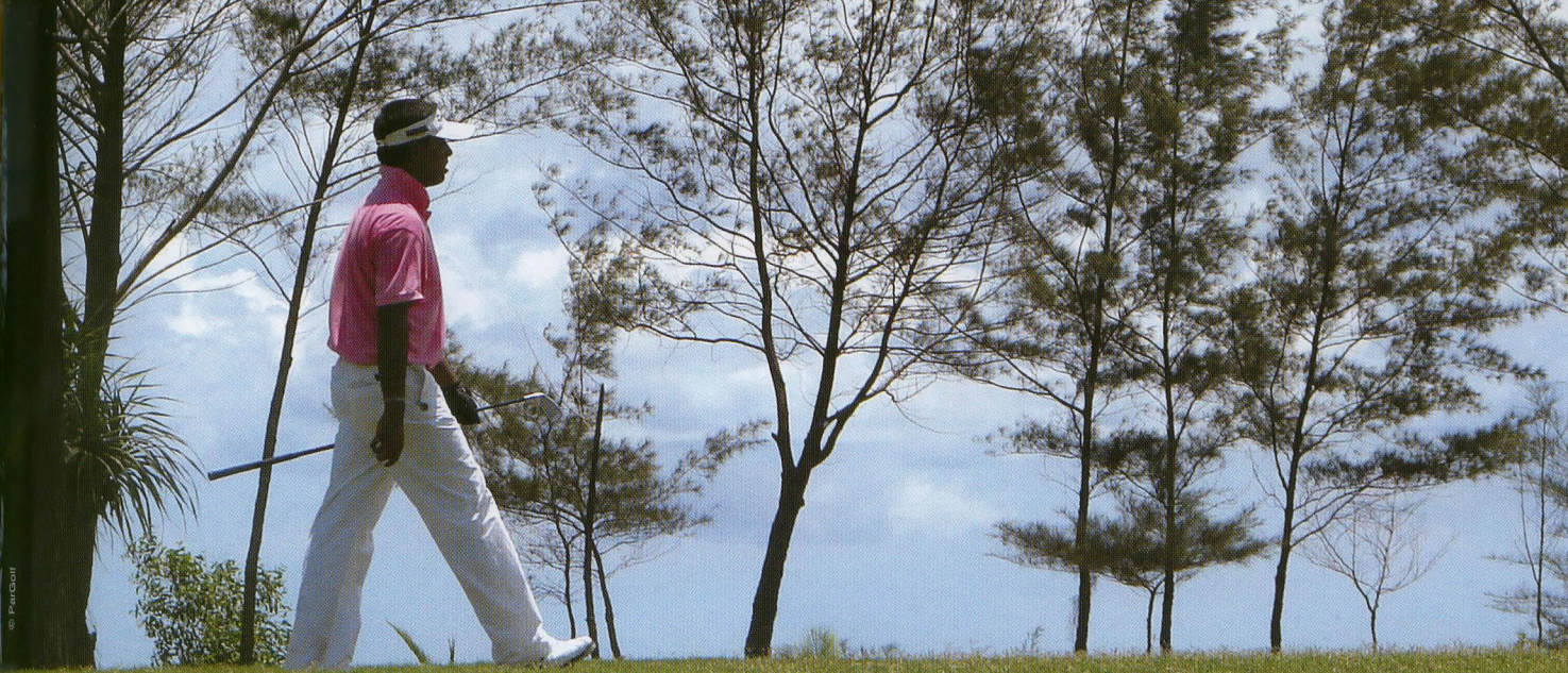
Anirban Lahiri at the 13th fairway

“The golf course is very beautiful, while the beach is nice. It’s unbelievable”